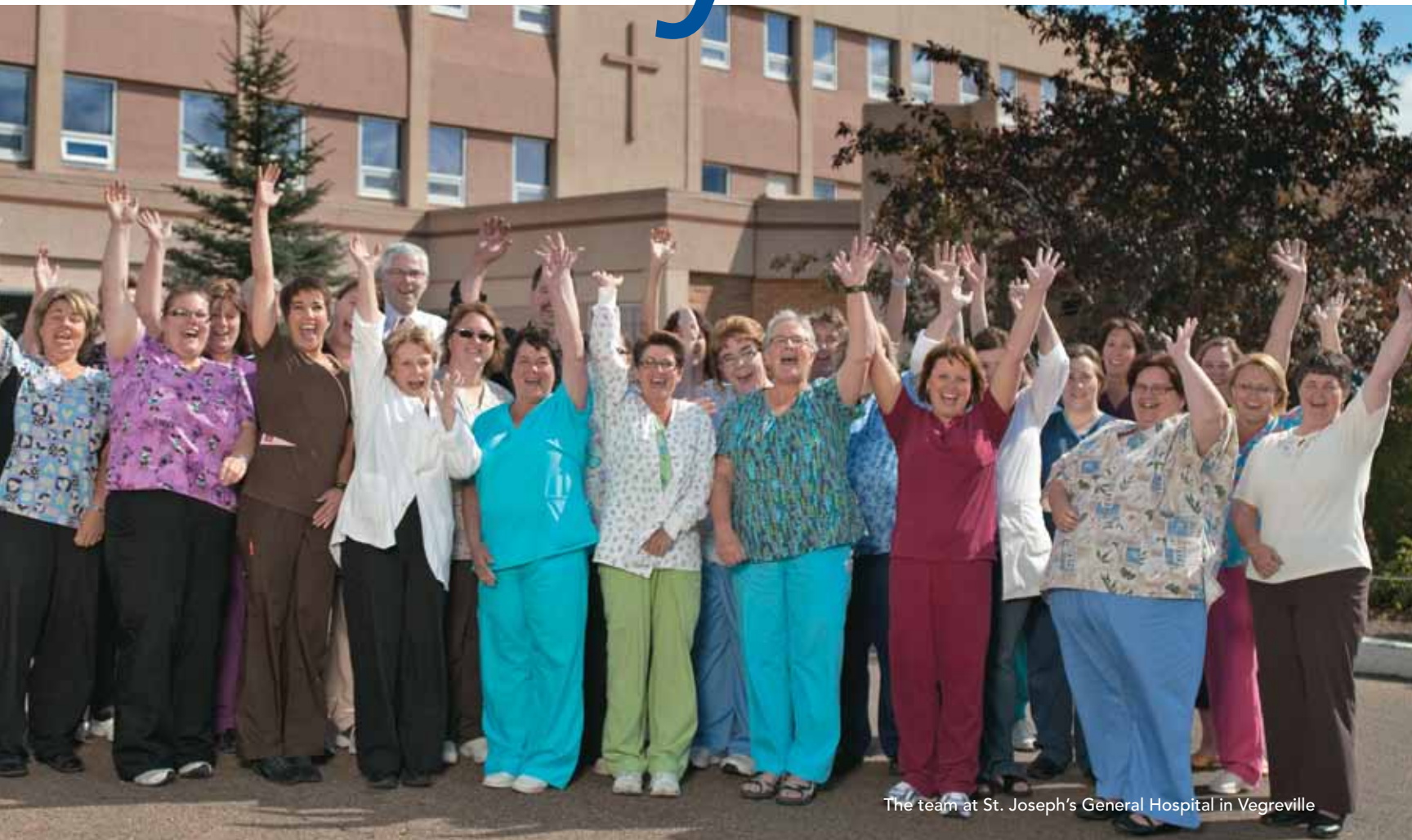
The team at St. Joseph's General Hospital in Vegreville

Vegreville facility prepare for the audit. She said the results are a reflection of the pride and sense of social justice the staff demonstrate every day.