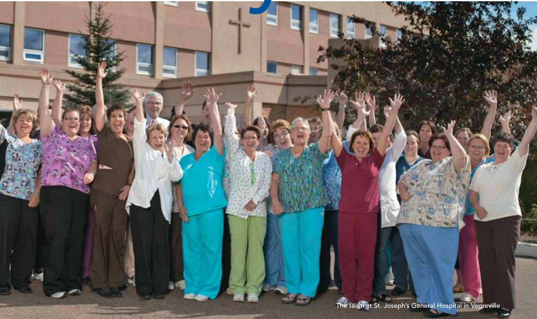
The team at St. Joseph's General Hospital in Vegreville

Vegreville facility prepare for the audit. She said the results are a reflection of the pride and sense of social justice the staff demonstrate every day.